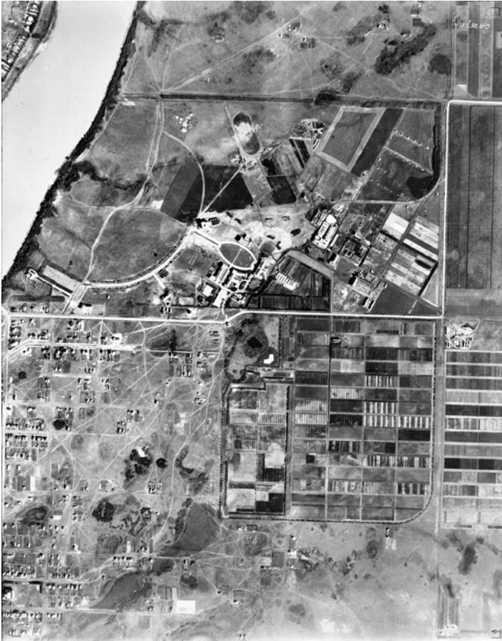
Aerial view of Varsity View and the University of Saskatchewan (1927)